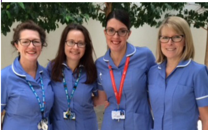
Members of the Research Nurse Team at UH Bristol

We conduct research that we believe makes a real difference to people. Not only do we want to improve ways of looking after patients with heart disease, we also want to let people know about the important breakthroughs we are making.