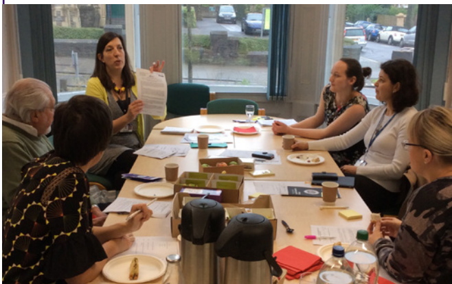
A PAG meeting, with BRC researchers